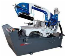
Pilous ARG plus S.A.F.