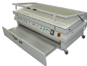
Vacuum membrane press