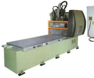
SCM Record 220