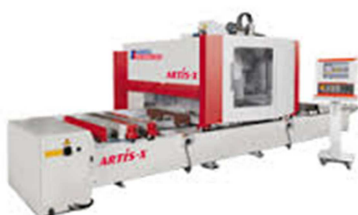
Reichenbacher Artis X-4