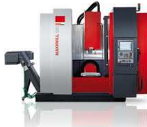
EMCO MaxxMill 500