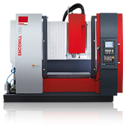
EMCO Mill 1200