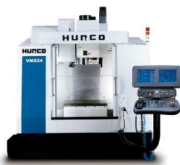
HURCO VMX 24