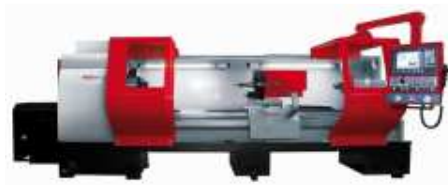
EMCO MAT E-300