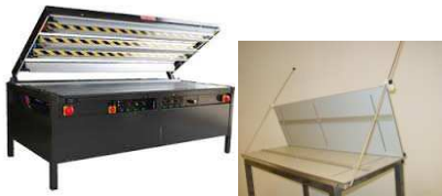
Shannon HRP 220