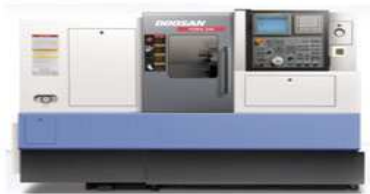
Doosan Puma 240 MC